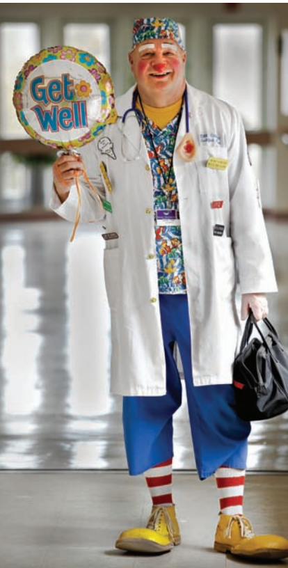
Bumper “T” Caring Clowns use gentle humor when visiting patients at Shore Memorial.