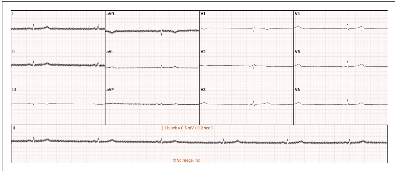
Figure 2. ECG demonstrating sinus bradycardia.

pressure dropped to 90 mmHg/45 mmHg, HR was 33 bpm, and her mean arterial pressure (MAP) was 60. Cardiology recommended to place the patient on a dobutamine drip at a starting rate of 2.5 \mu\text{g}/\text{kg}/\text{min} . The dobutamine was titrated up to 5 \mu\text{g}/\text{kg}/\text{min} to maintain an HR above 50 bpm, but the patient was unable to tolerate the medication due to episodes of palpitations. The drip was subsequently titrated back down and discontinued after a total duration of 10 h due to intolerance and improvements in her HR. Cardiology initiated an order for terbutaline tablet 5 mg by mouth to be administered if her HR dropped below 50 bpm. The patient was able to maintain her HR above 50 bpm and terbutaline was discontinued.